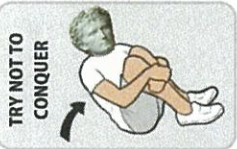
TRY NOT TO CONQUER