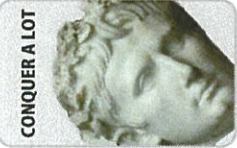
CONQUER A LOT